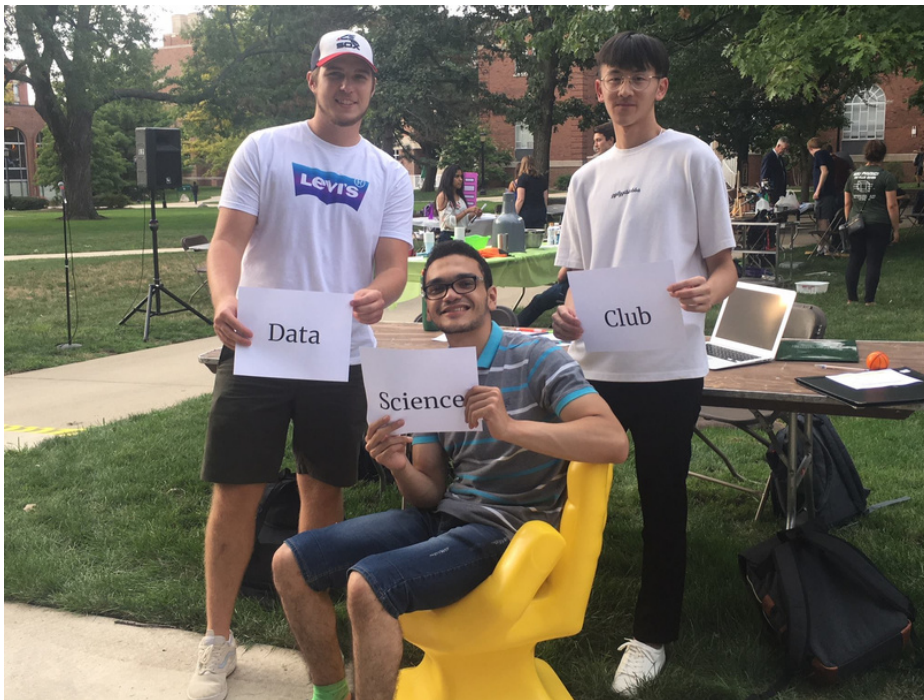
PHOTO: ILLINOIS WESLEYAN UNIVERSITY RSO FAIR, FALL 2019

Most Americans value personal cleanliness. They shower at least once daily—generally in the morning—and oftentimes more if they perspire in sports or if it is a hot day. You will be expected to have clean, shampooed hair, to wear clean clothes, and to brush your teeth daily. Empty your trash regularly; wash your clothes after you have worn them, don't wear dirty or sweaty clothing most Americans wash clothes after having worn them for a day; if you have a refrigerator, keep it clean.