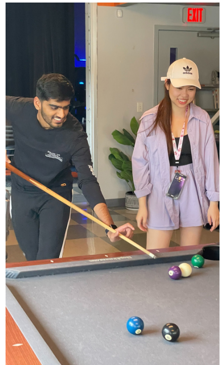
PHOTO: INTERNATIONAL STUDENT PRE-ORIENTATION 2022