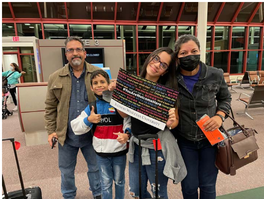
PHOTO: INTERNATIONAL STUDENT MOVE-IN DAY 2022