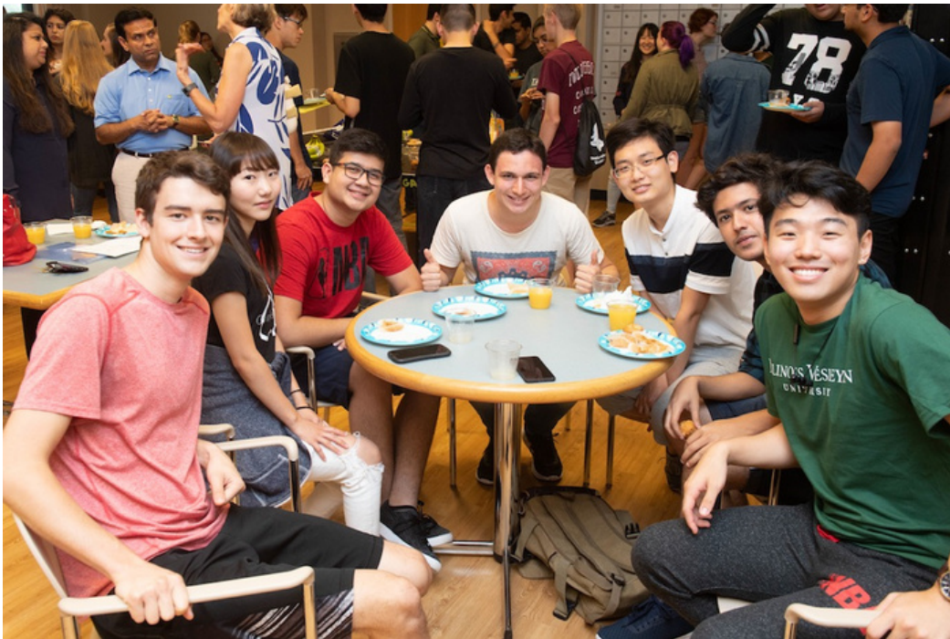
PHOTO: INTERNATIONAL STUDENT PRE-ORIENTATION, SUMMER 2018

When eating in restaurants people order individually and often pay for their own meal. Customers at restaurants are expected to leave 20% of the cost of the meal as a tip to the server. Restaurant servers get paid very little, and expect to be tipped for their service to the customer.