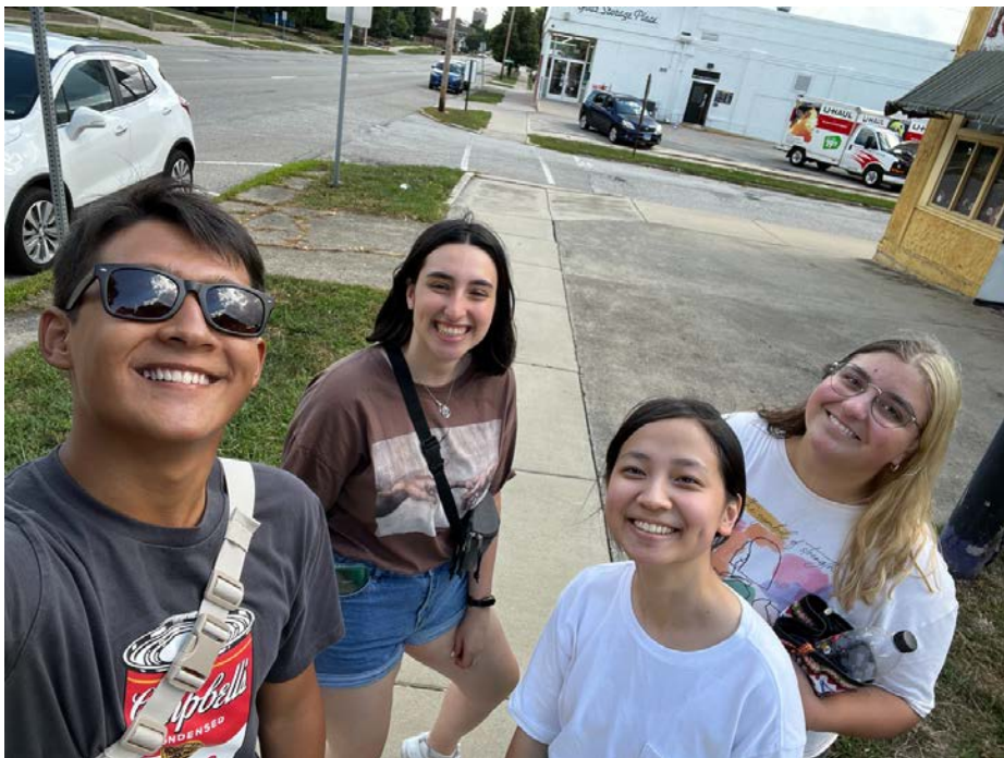
PHOTO: INTERNATIONAL STUDENT PRE-ORIENTATION 2022