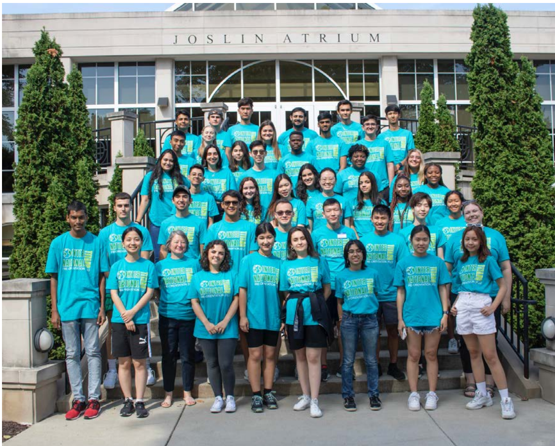
PHOTO: INTERNATIONAL STUDENT PRE-ORIENTATION 2022